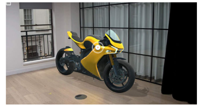
In addition to the provided elements, users can import custom 3d objects and use them as part of the workflow. The most convenient option would to be to use .glTF based 3d models, as these can be used with the system directly. It's an open standard ensuring compatibility with different platforms, software, and hardware.