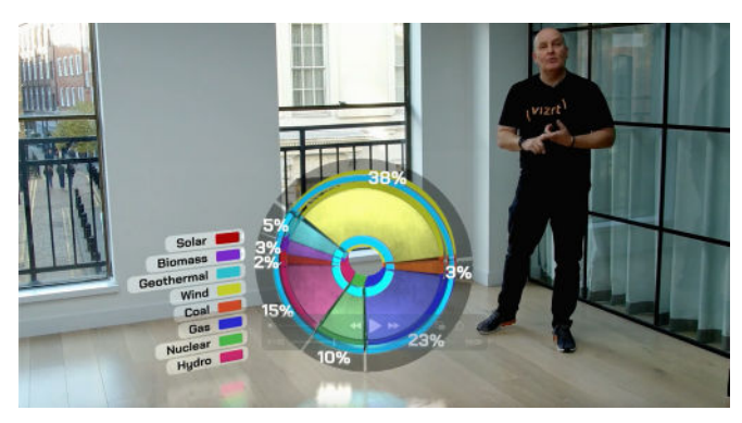
Pie charts are useful for displaying data that can be divided into parts or proportions of a whole. They are commonly used to present data related to demographics, percentages, and proportions.