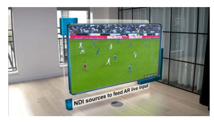
Screen is a virtual screen presented as an AR element; this screen can host NDI Input, Images, Clip, Graphics, or a live webpage, allowing users to browse through News, Sports, or Financial information on any web page