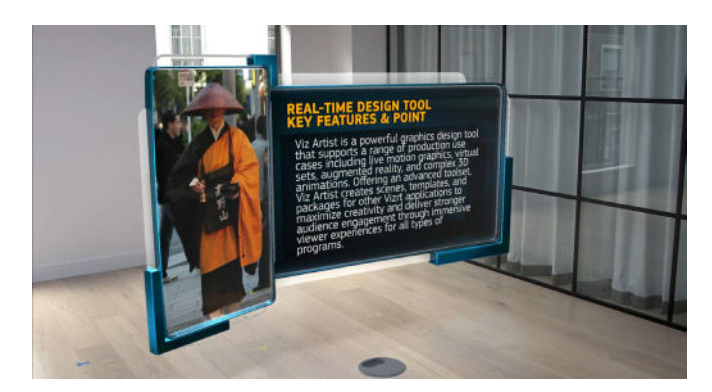
Text box elements are ideal for presenting free text on screen; the graphics element also includes a headline and the possibility of having a side panel that can show NDI Input, an image, or a clip.

Many of the elements can be easily customized, such as changing colors. In addition, 3D objects can be imported in standard formats, and Designers can use Viz Artist to create original AR graphic assets and virtual set scenes.