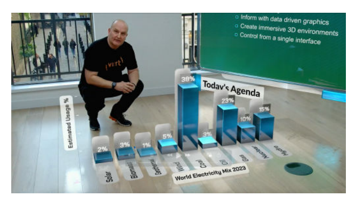
Bar graphs are a suitable way of presenting data that can be split into distinct categories.